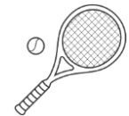
I. ( )