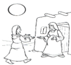
E. ( )