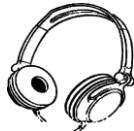
C. ( )