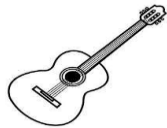
B. ( )