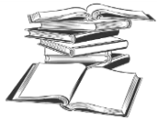
D. ( )