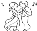
G. ( )