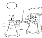
E. ( )