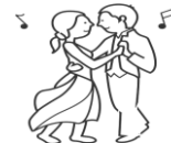
G. ( )