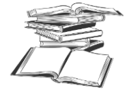
D. ( )