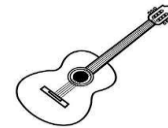
B. ( )