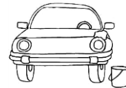
A. ( )