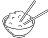
F. ( )