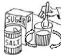
E. ( )