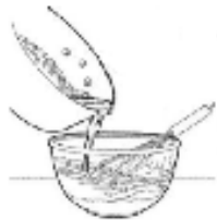
C. ( )