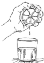
A. ( )