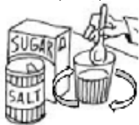
E. ( )