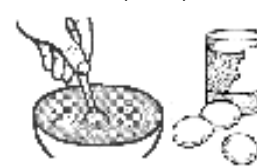
F. ( )