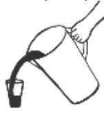
G. ( )