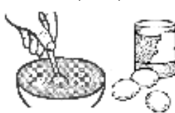
F. ( )