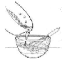
C. ( )